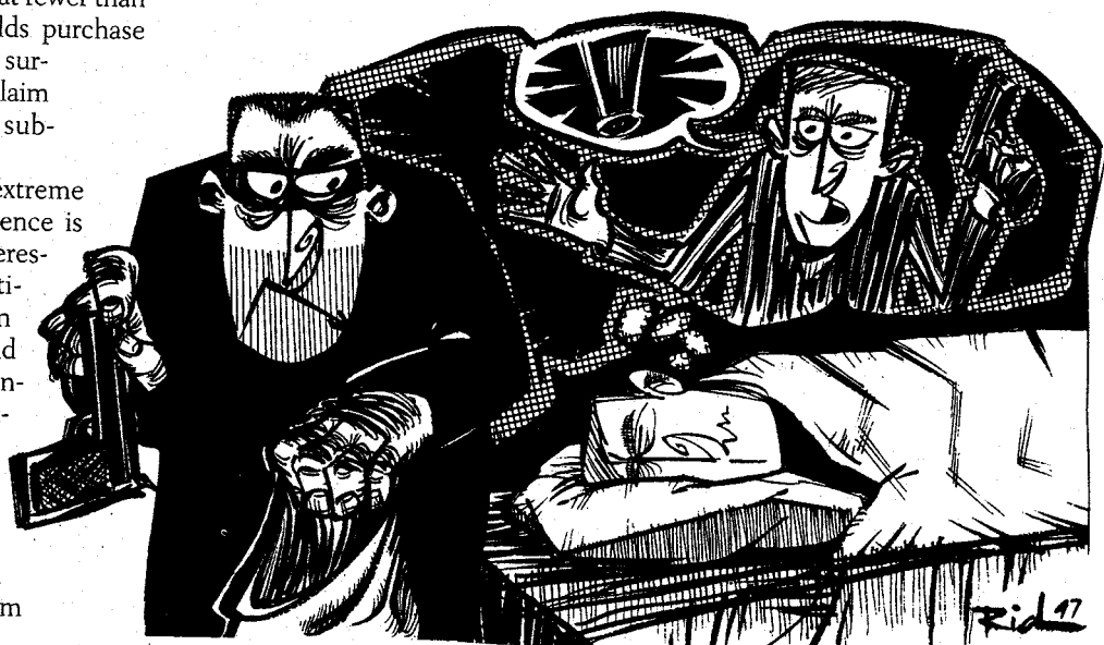
Cartoons courtesy of Richard Wentworth

The mean height from the mothers' reports was reasonably close to the mean height as measured by the experts. The variance of the heights was dramatically different, however. The estimate for the standard deviation of reported heights was more than double that for the scientifically measured heights, suggesting large "measurement error" in the mothers' reports.