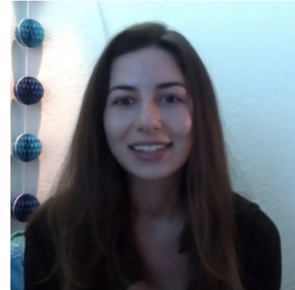
Advice for Honors Thesis Writers